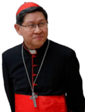
Cardinal Luis Antonio G. TAGLE, Prefect of the Congregation for the Evangelization of Peoples

VA31001000000040286004 (SWIFT/BIC: IOPRVAVX) (€) VA04001000000040286005 (SWIFT/BIC: IOPRVAVX) (USD $) for: Amministrazione Pontificie Opere Missionarie, indicating: Fund Corona-Virus