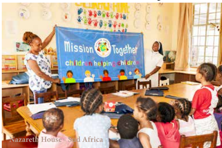
Nazareth House - Sud Africa

Many diocesan schools promote Catholic character education, based on